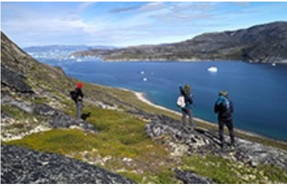
Transfer to airport

This itinerary, including walking distances and times, is indicative and fully flexible.